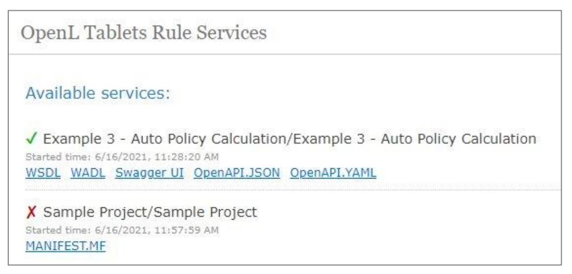
Figure 4: List of projects displayed upon OpenL Tablets Rule Services launch

When OpenL Tablets Rule Services is launched using the <code>openl:port/webservice</code> link, the system displays a list of deployed projects.