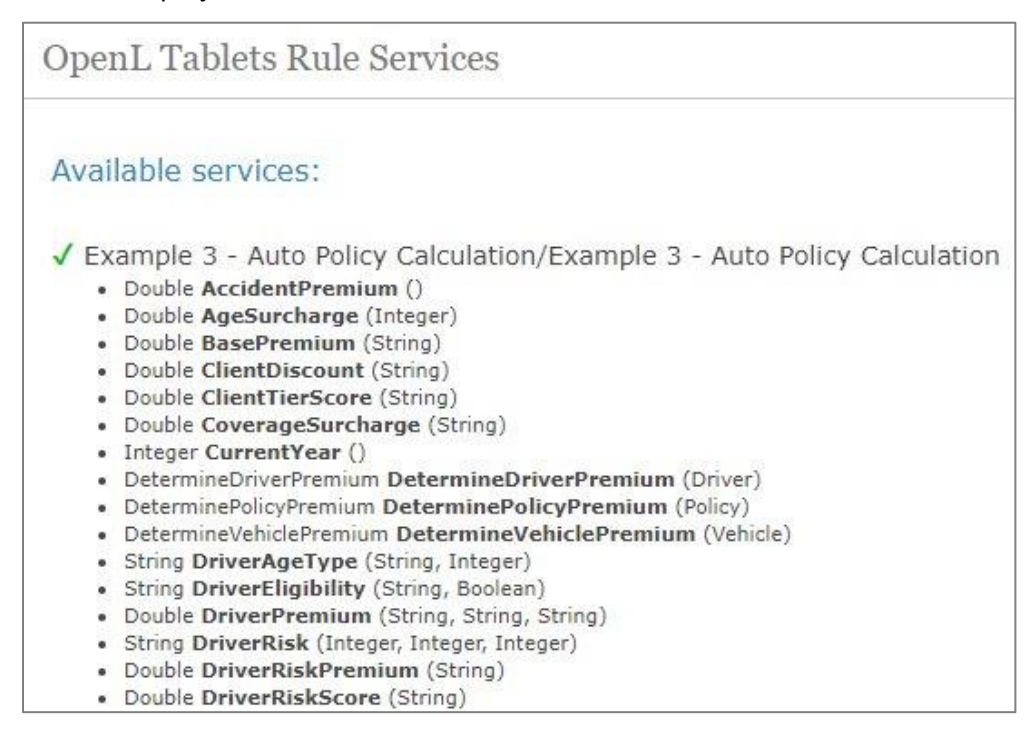
Figure 5: Expanding project methods

The successfully deployed projects appear with the green check mark that can be clicked to expand the list of available methods for the project.